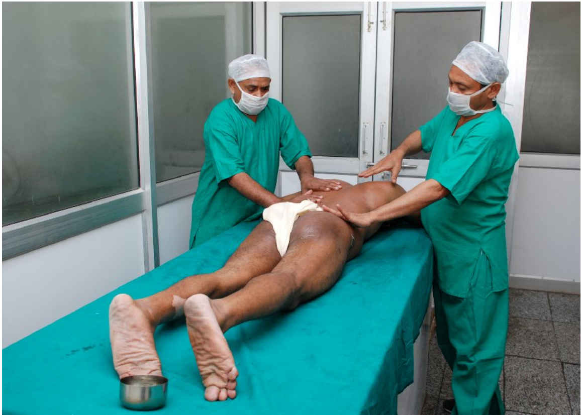
ABHYANG IN VARIOUS POSITIONS