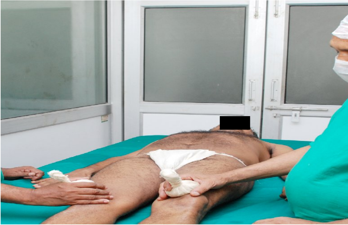
PATRA PINDA SWEDA