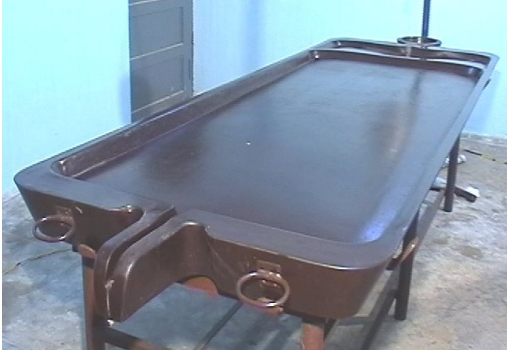
PANCHAKARMA DRONI (TUB)